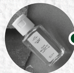
● Etihad Hand sanitizer bottle (30 ML)