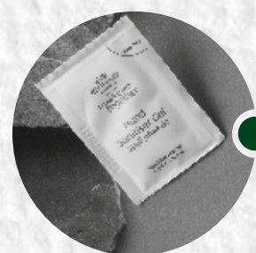
● Etihad Hand Sanitizer Sachets (1.2 ml)